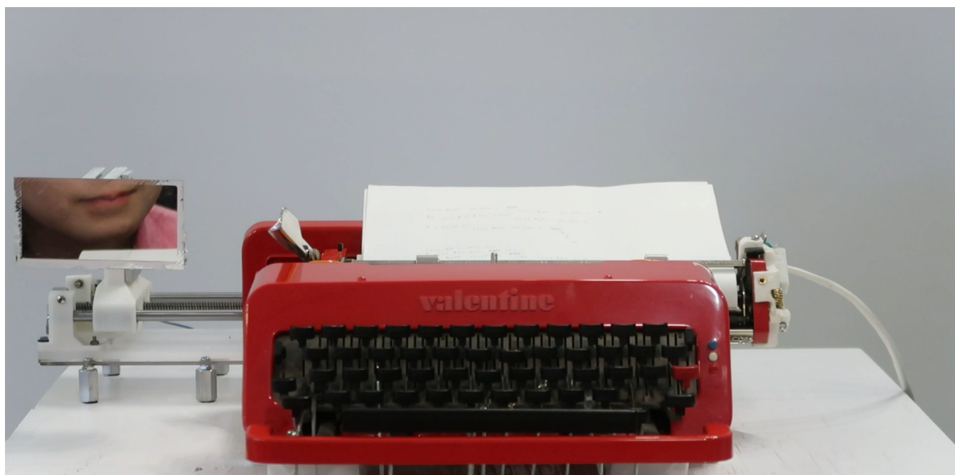
Figure 1: Automated vintage typewriter installation. It recognize the audience's speech and transcribes into Morse code with glitches.