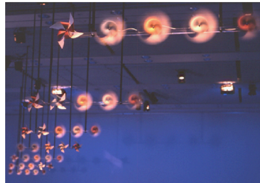
Figure 3 Pinwheels spinning in Tokyo in a wind of e-mail traffic at MIT

We mounted five pinwheels onto each of 8 supporting rods, and spatially distributed the rods across the gallery space (diagonally from the entrance to the back), with equal intervals between them. We decided to interpret this line of