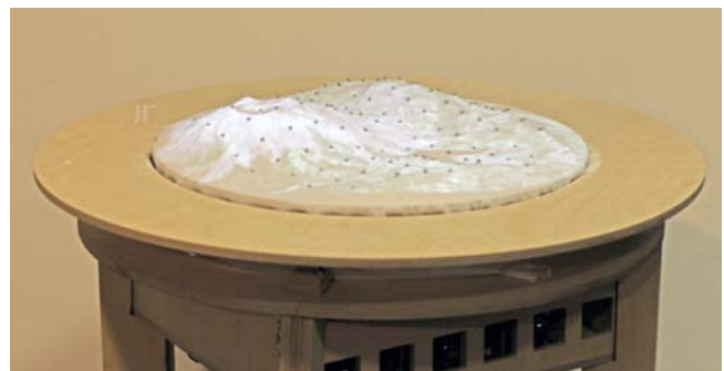
Figure 2. Relief system with pins covered with Lycra surface and top projected landscape.