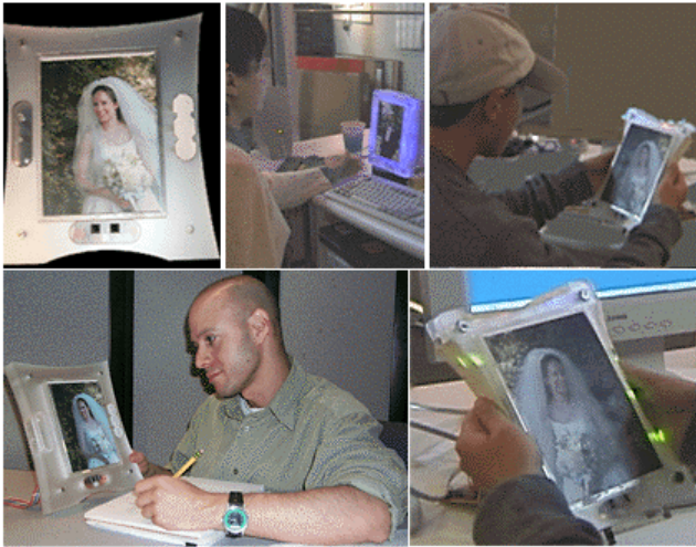
Figure 3: (Clockwise) A LumiTouch when off, a user working with LumiTouch in passive mode, the feedback panel on top lights up when sending a message, the display lights up when receiving a message, a user interacting with LumiTouch.