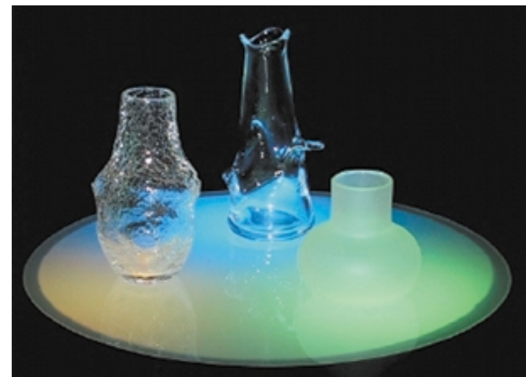
Figure 1. The three genie bottles (Junar on the left, Seala in the center, and Opo on the right).