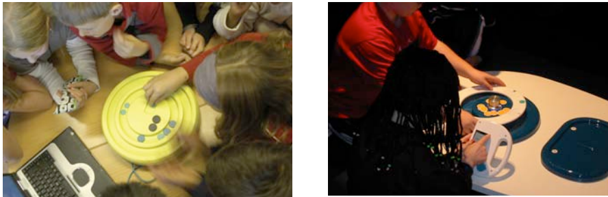
Fig. 2. First prototype of the table vs its final prototype